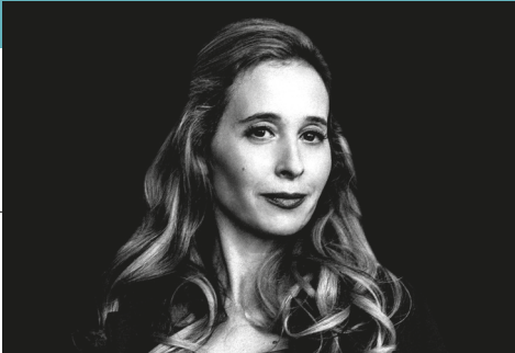
Noreena Hertz Economist and author of The Lonely Century